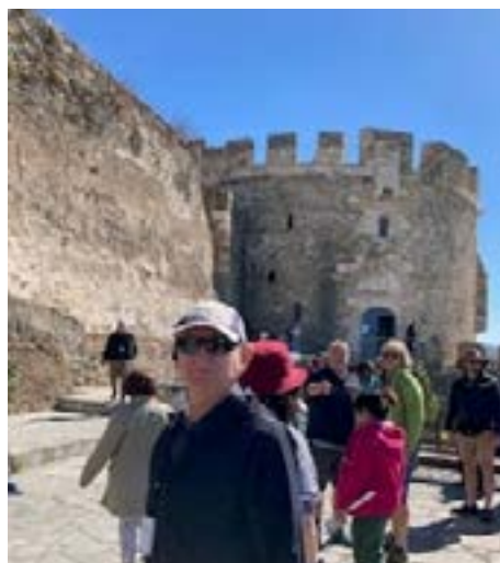
Outside the walls of Thessalonika, Greece. (Ref. Letters of St Paul to the Thessalonians) Greece