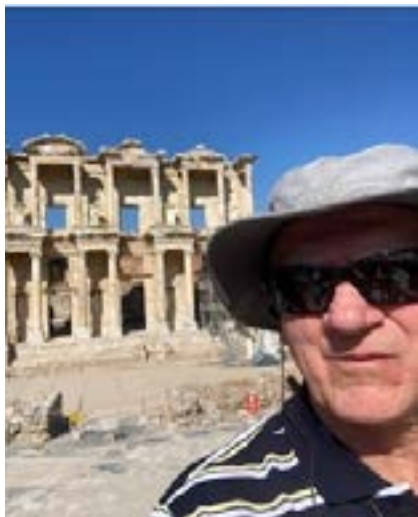
At the site of the excavated and reconstructed Library of Celsus in Ephesus, Turkey (Ref. Letter of St Paul to the Ephesians).